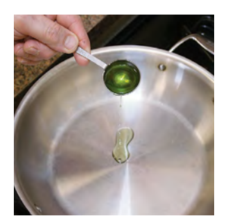
► In a large sauté pan or wok, heat the grapeseed oil over medium-high heat.