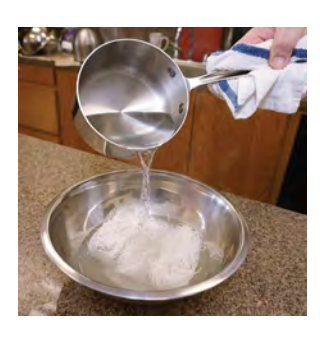
► In a large bowl, soak the rice noodles with boiling water. Allow to sit for 20 minutes, drain, and rinse with cold water; reserve.