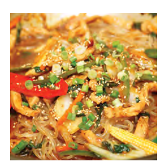
▶ Portion the stir fry onto serving plates. Garnish with sliced scallions and toasted sesame seeds. Enjoy.

➤ Drain all the excess water from the reconstituted rice noodles. Add the noodles to the hoisin pork and vegetables and toss together until the sauce and noodles are hot.