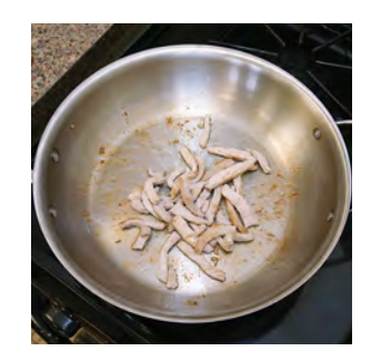
► Add the pork and toss quickly. Cook to a light golden brown on all sides. Keep the heat as high as possible without burning the pan.