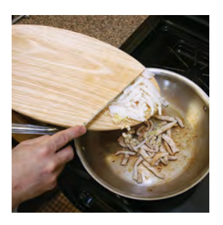
Add the onion, garlic, and ginger and toss together for I minute.