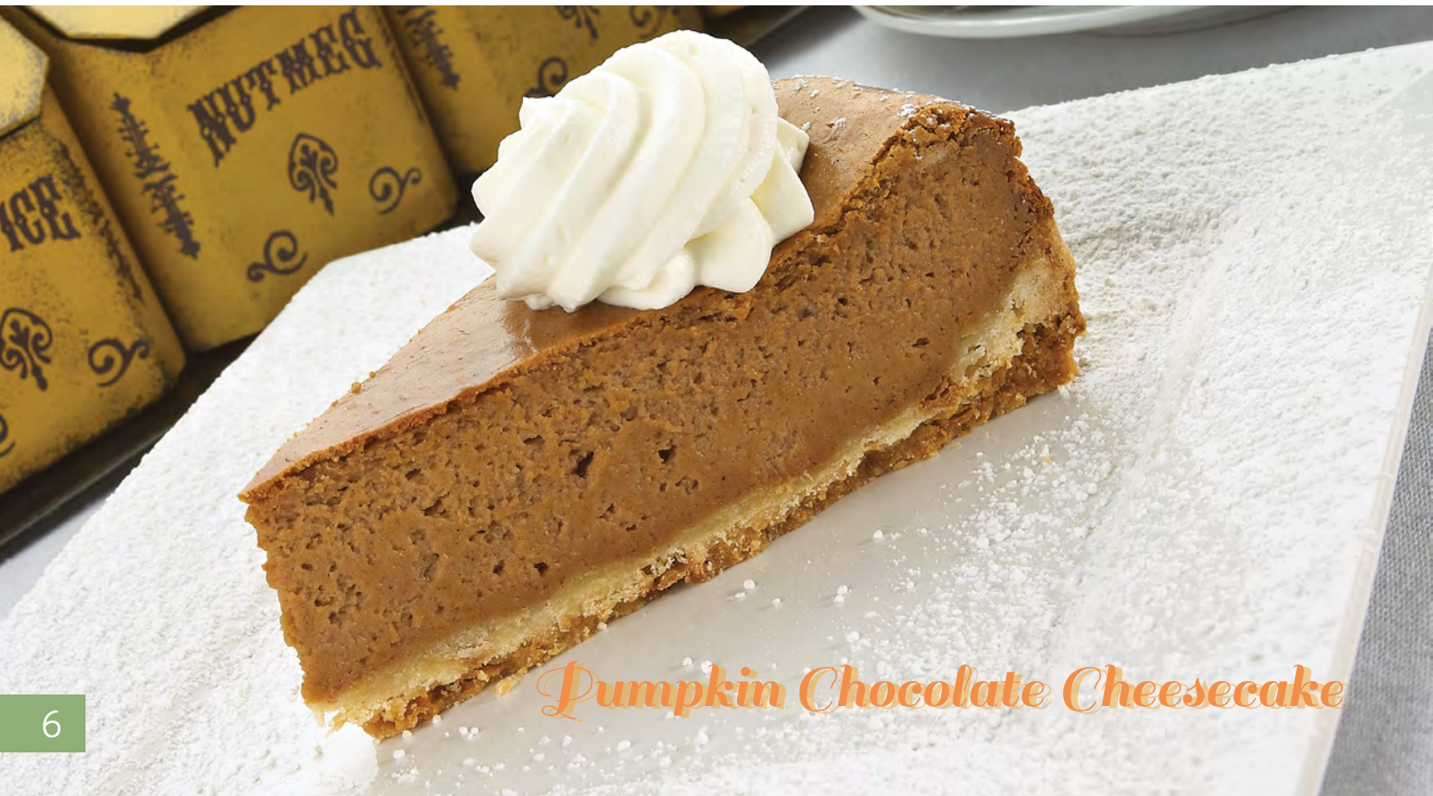
Pumpkin Chocolate Cheesecake

A cool and refreshing citrus flavor. Use as a flavorful icing with our Not Your Everyday Pound Cake! Or, use as a filling with our new dessert bar crusts!